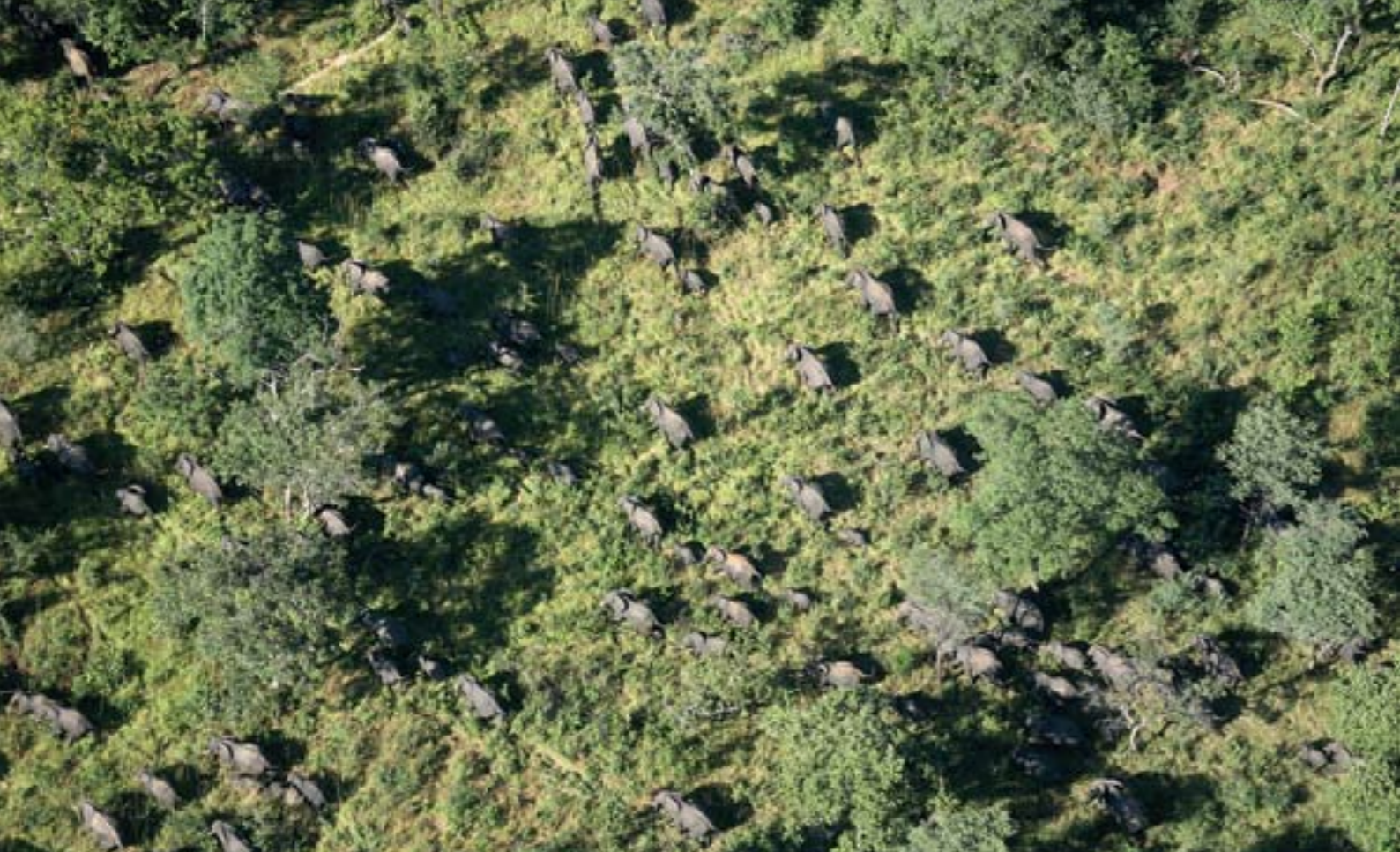
ABOVE A large herd gathers to enjoy the bounty of the miombo woodlands in Sioma Ngwezi National Park, Zambia, during the wet season.

OPPOSITE, TOP With little else to browse on, elephants rely heavily on mopane during the dry season, causing much concern and debate about the carrying capacities of these forests.