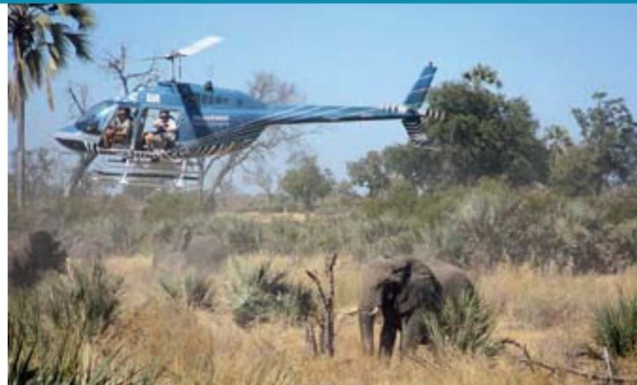
ABOVE A matriarch is darted on the Angola–Namibia border in the Caprivi Strip.