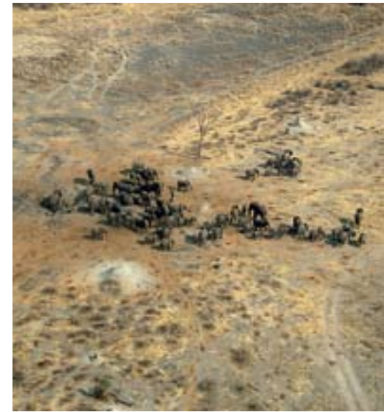
Sixty-nine thirsty elephants wait their turn to wallow in one of the few shallow pans in Khaudum National Park, Namibia.

On the way to Menongue, the provincial capital of Kuando-Kubango, I was amazed by the vastness of the province and the absence of people and wildlife. Under Portuguese colonial rule, the region had abundant game, ▶